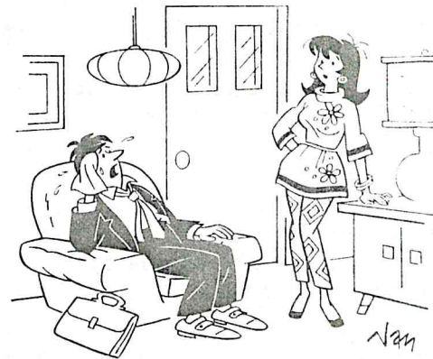
"WHAT A DAY! THE COMPUTER BROKE DOWN AND WE ALL HAD TO THINK!"