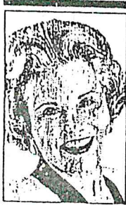
By Ann Landers

Dear Ann Landers: I am sending you an essay put together by Richard Lederer, a teacher at St. Paul's school. It is made up from lines in student papers, collected