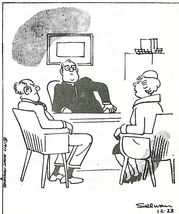
"He thinks if he watches 'Charlie's Angels' he doesn't have to go to church on Sunday!"

A wildly excited man ran into the police station shouting, "I need help, A man just stole my car!!!". "Did you see him?" asked the desk officer. "No, but I got the license number as he pulled away!!"