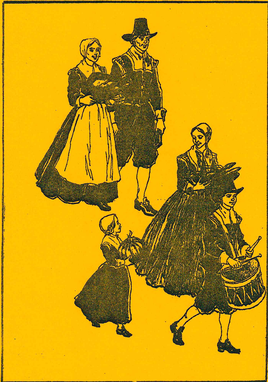
THANKSGIVING DAY IN 1620